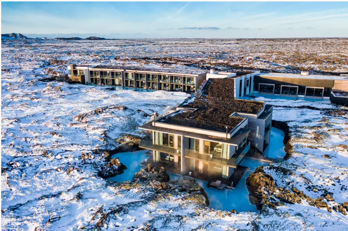
BLUE LAGOON ICELAND