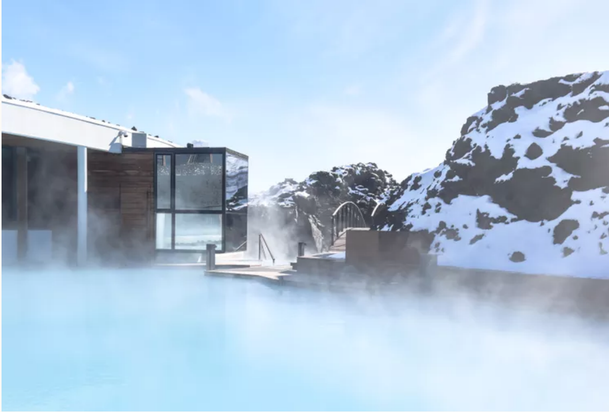
BLUE LAGOON ICELAND

Once you touch down in Iceland, take a few days to get your bearings and relax before heading out into the epic landscape. Here are a few of the can't-miss activities we recommend—and remember, when possible, book experiences ahead of time!